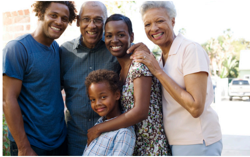
Family and friends

Once you have moved you will need to tell people your new address. Here are a few ideas of people you need to tell: